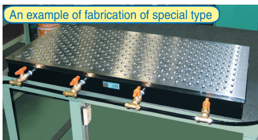
An example of fabrication of special type